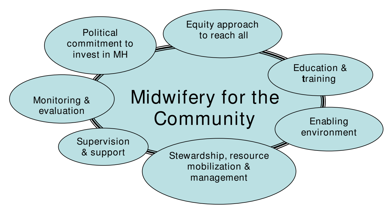
Figure 2 Framework for addressing issues of scaling-up midwifery for the community level.