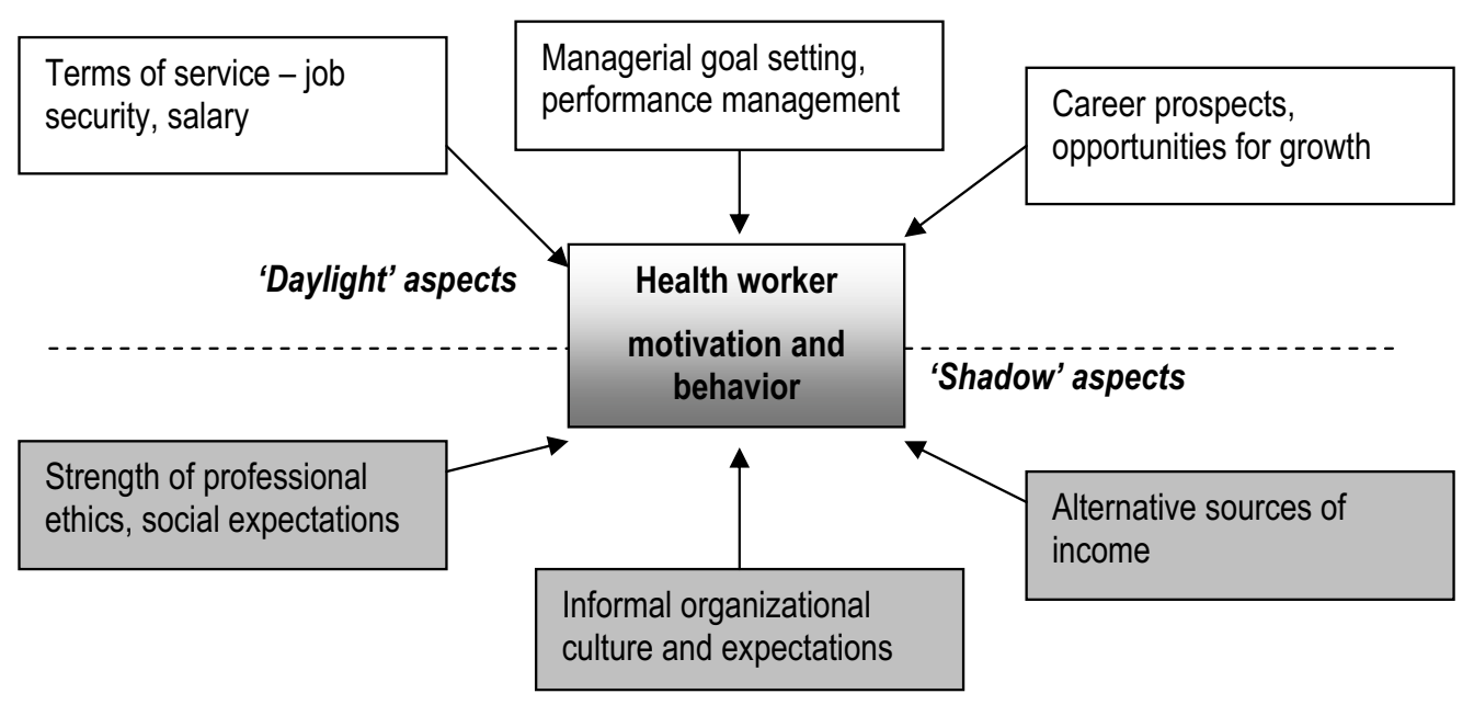
Figure I Factors affecting worker motivation and behavior.

On the 'daylight' side, workers may feel they have little to gain from working hard or being responsive to either their clients or superiors. Poor career paths and promotion opportunities lead to health workers feeling 'stuck', while official salaries often cover only part of a worker's needs or overall income (given alternative livelihood strategies,